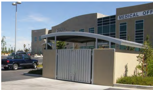
A great example of covered waste dumpsters!