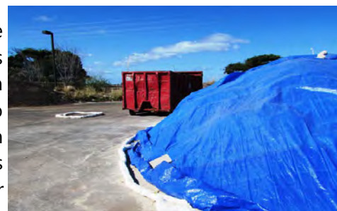
Properly covered stockpiles.

contamination once storm water comes in contact with trash. According to the IGP, an industrial facility is required to “cover industrial waste disposal containers and industrial