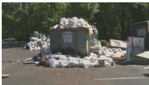
Oscar would be proud!

Sometimes the task of trash management on an industrial facility may seem beyond feasible, but here are some of the